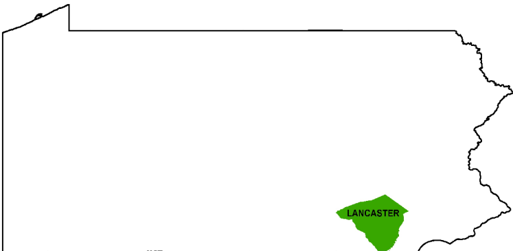
Workforce Development Area (WDA) Unemployment, Jan 2014 to Feb 2024