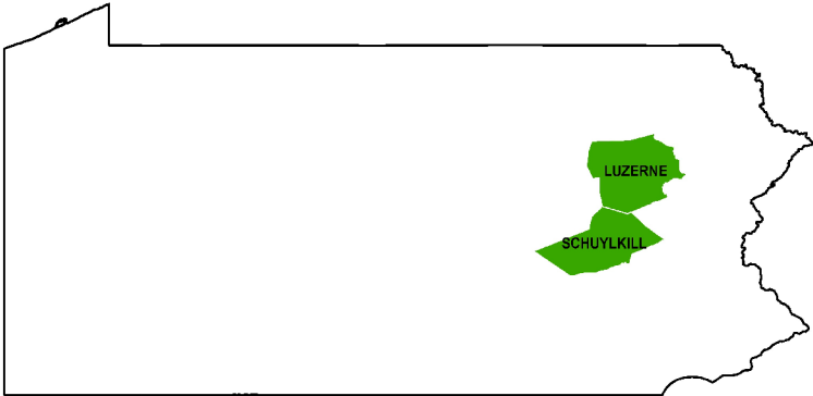
Workforce Development Area (WDA) Unemployment, Jan 2014 to Feb 2024