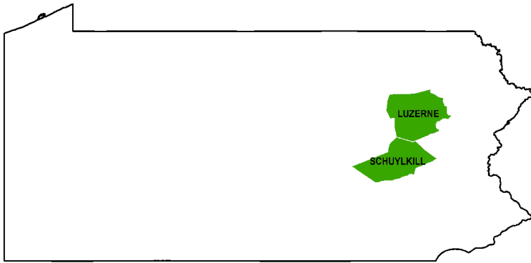
Workforce Development Area (WDA) Unemployment, Jan 2008 to May 2018