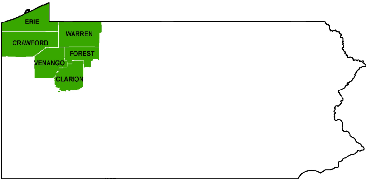
Workforce Development Area (WDA) Unemployment, Jan 2013 to Dec 2023