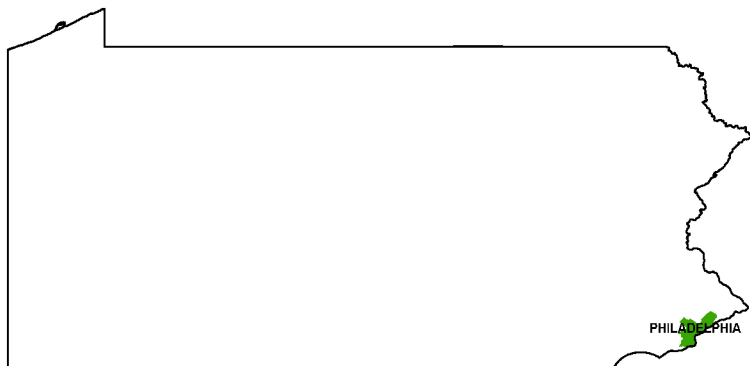
Workforce Development Area (WDA) Unemployment, Jan 2013 to Jan 2023