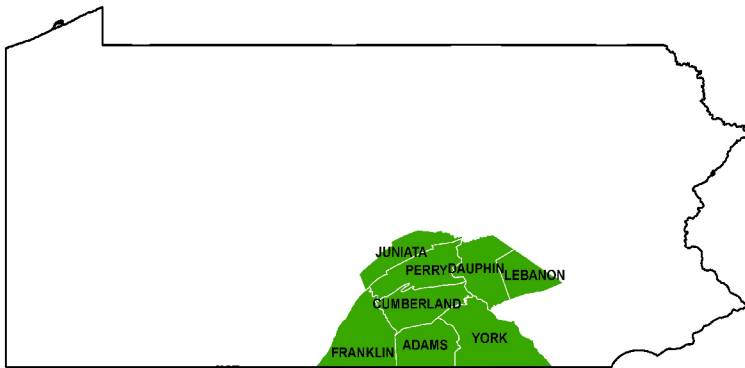
Workforce Development Area (WDA) Unemployment, Jan 2013 to Jan 2023